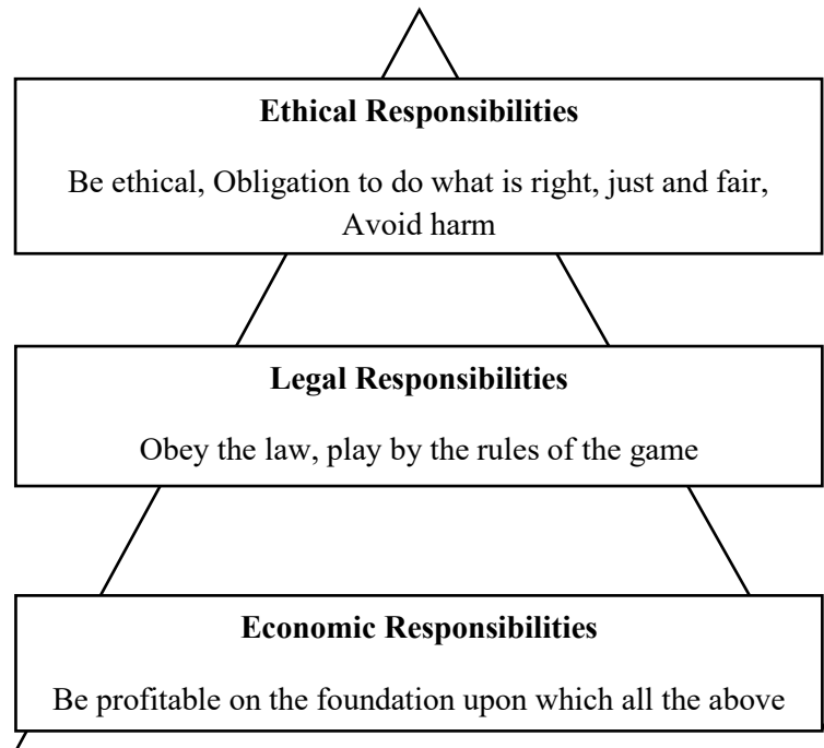
Figure 1. The pyramid of Corporate Social Responsibility model by Carroll, 1991.